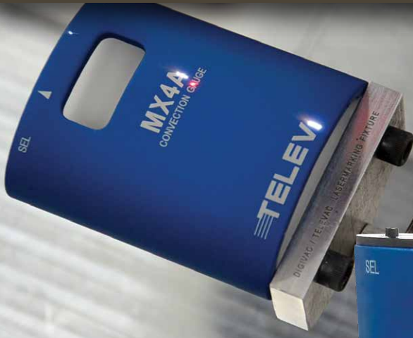
Laser marking of elliptical housing on novel fixture